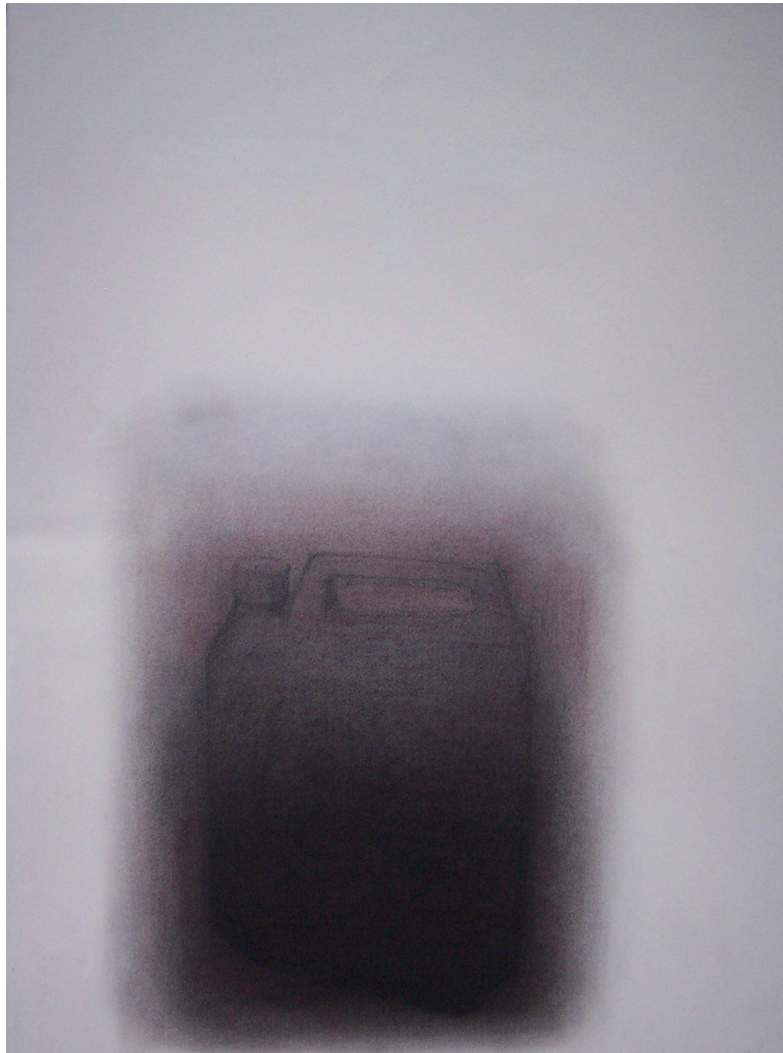
Vapouration 30 x 20 inches watercolour on paper